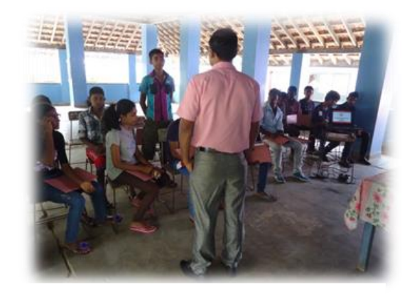
Introducing & Knowing each other

The Hony Chairman, Hony Vice Chairman, Hony Secretary & three committee members visited & observed the training and Hony Chairman addressed the participants. The Branch spent Rs.40,000.00 out of Branch own funds for this three days training and would look forward to uplift the Branch position under the WF BRE 2014 system .