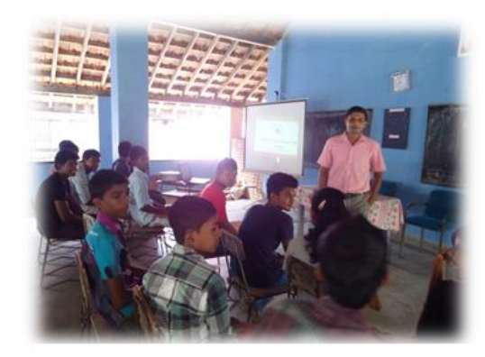
Anxiousness among participants