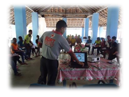
Clever & creative teaching is an asset