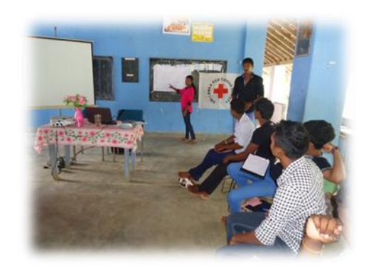
Strengthening presentation skills