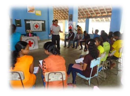
Friendly atmosphere at lectures