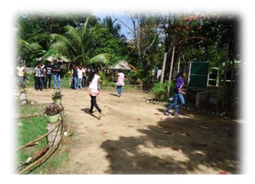
Outbound teambuilding activities